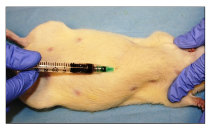
Figure 2. Aspirate Gently for Blood Collection