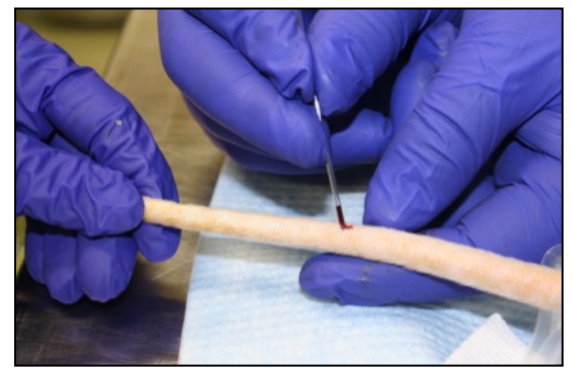
Figure 4. Using a Hematocrit Tube